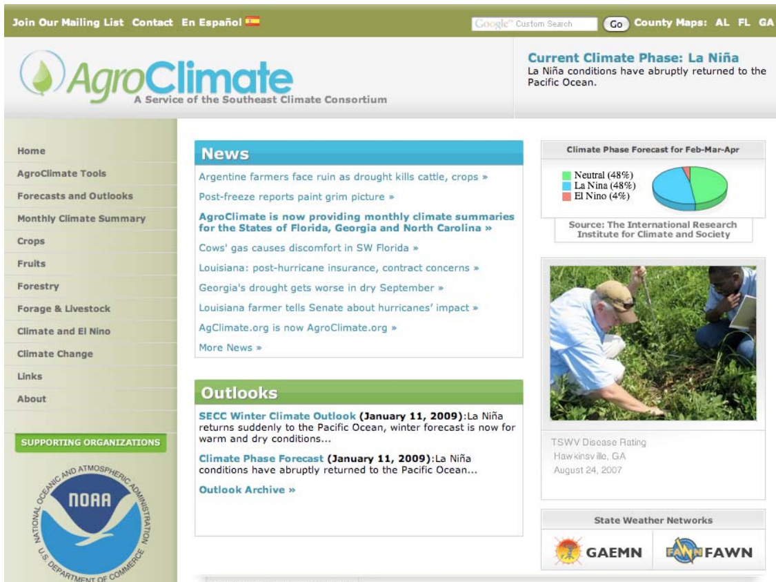
Fig. 1. A new layout was developed and implemented in 2008.

Enhanced cooperation with state weather networks resulted into the improvement of the AgroClimate chill accumulation tool to include by-weekly updates of chill accumulation observed at weather stations belonging to the Florida Automated Weather Network (FAWN) and Georgia’s Automated Environmental Monitoring Network (AEMN). Observed accumulation is updated by-weekly and seasonal chill accumulation is predicted taking into account current levels of accumulation observed at FAWN or AEMN stations (Figure 3). Chill accumulation is calculated based on the number of hours below 45°F, 32-45°F and also in terms of chill units for several temperate fruits such as peach, blueberry, and strawberry. (C. Fraisse)